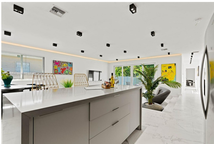
MODERN CABINETS AND APPLIANCES