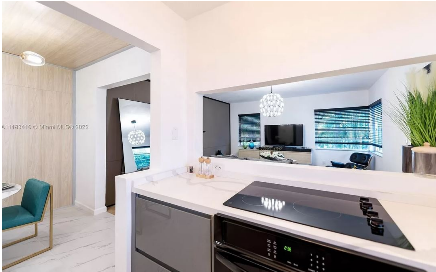
NEW STAINLESS STEEL APPLIANCES

611 Michigan Ave #2, Miami Beach, FL 33139