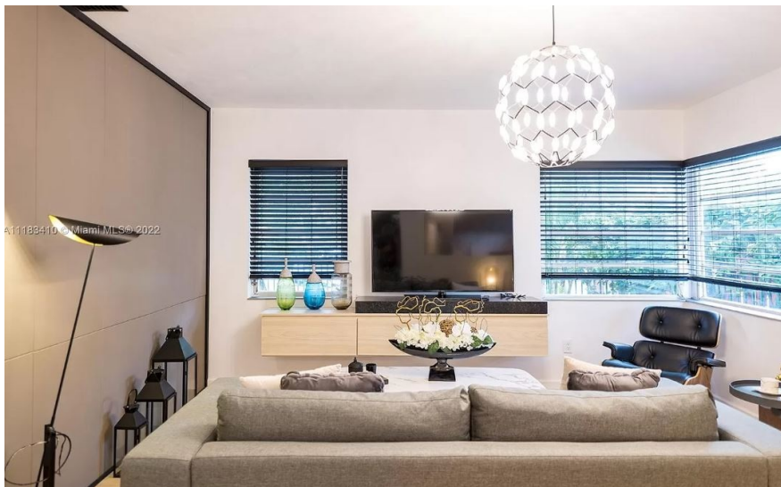
SPACIOUS AND COMFORTABLE LIVING AREA